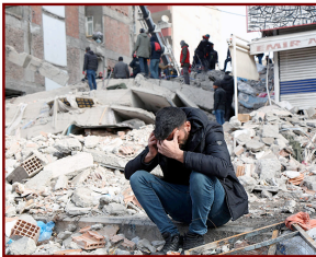
Turkey Earthquake – 2023