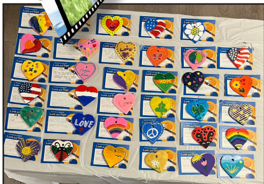
Auxiliary Hearts of Hope "Paint With a Purpose" (See page 2 for details.)